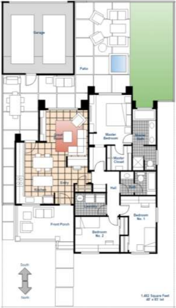
Right-Size Floor Plan: 1,480 Square Feet

Admittedly I'm a very harsh critic of most home designs. So I'll let you all be the judge with one of my old designs shown below to demonstrate how a floor plan less than 1,500 square feet can live larger than most typical 2,000 square foot floor plans. More about what I would do with 500-plus square feet of hard cost savings later.